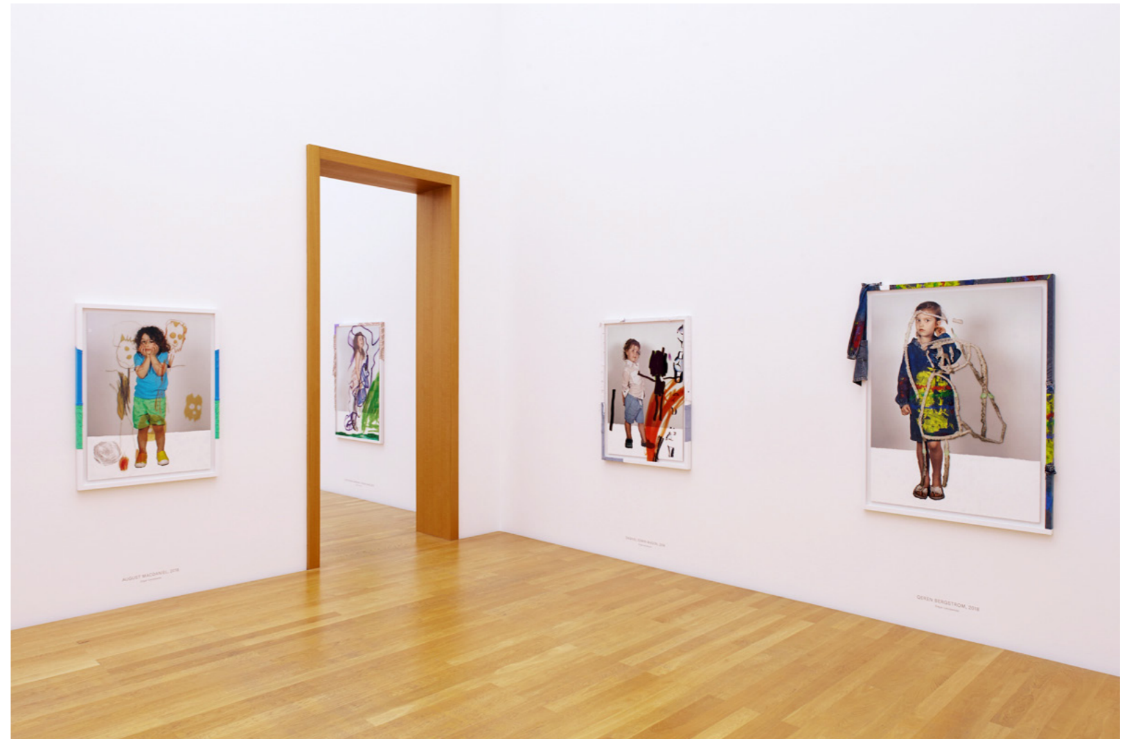
Installationsansicht Museum der bildenden Künste Leipzig, 2018